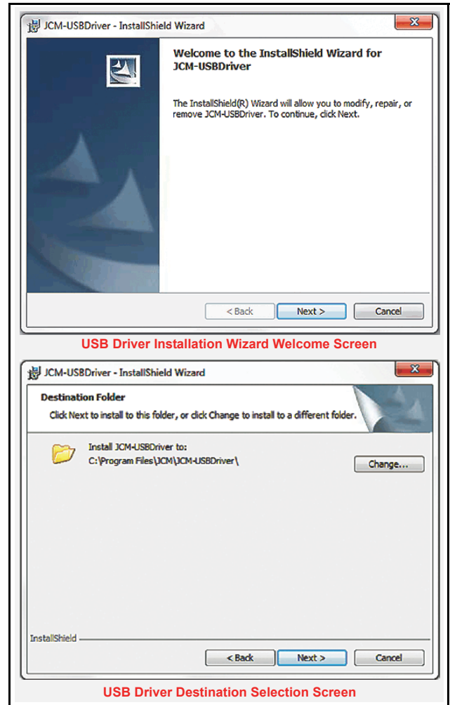
Typical USB Driver Installation Wizard Screen

To obtain the JCM USB Drivers for the Windows® 7 OS Platform, contact JCM Technical Support at techsupport@jcmglobal.com , or call (702) 651-0000.